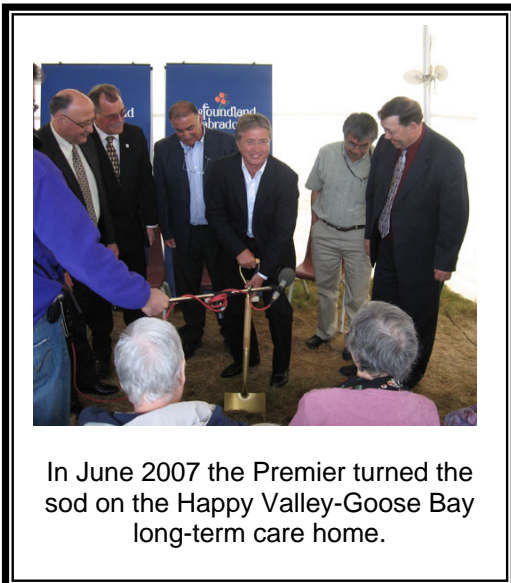
In June 2007 the Premier turned the sod on the Happy Valley-Goose Bay long-term care home.

Renovations to the existing Blue Crest Nursing Home in Grand Bank are underway. The redevelopment of the 60 bed long term care home should be completed by summer 2008.